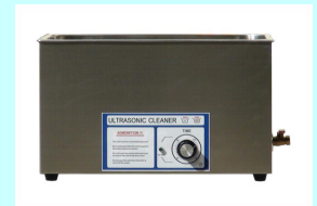
PS-100T (30 L)