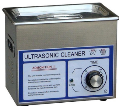
3L Mechanical ultrasonic cleaner

Family use: headwear, brooch , glasses , pens , CDs, shavers , combs, toothbrushes , dentures, bottle teats etc. Repair store: auto parts, cylinder,gear,screw etc.Jewelry store:bracelets ,ring,earring,necklace etc.Electronic products: circuit board ,hardware accessories.Office use:seal,stamp.printer head etc.